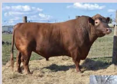
Bonanza's Rob Roy

Our Red Coral cow has been a prolific donor and outstanding producer for us. Red Lodge, a full sib to these embryos, was a popular sale attraction in our 2018 sale, half interest selling for $12,000.