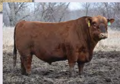
Red Lodge, full sib to the lot 25 embryos