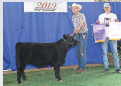
EZ Gloria 1G, full sib to the lot 23 embryos

All AI certificates necessary to register calves produced from the embryos in this sale will be provided at no cost.