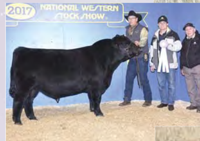
All Jammed Up 00B

Jasmine is great donor by Lisbon, out of the National Champion Fantasia, making her a maternal sister to the ever popular EZ Cinderella 61U. These embryos will be full sibs to the Big E Champion and Iowa State Fair Reserve Champion EZ Gloria 1G and paternal half sibs to EZ Tenille 42F, 2019 National Reserve Champion Female.