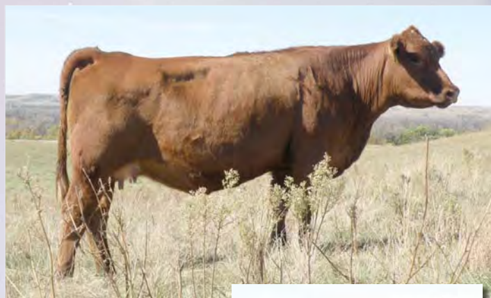
Miss XL W96E, donor for Lots 27 and 28

Another outstanding set of halfblood embryos out of the good Red Angus X Simmental donor W96E. These embryos are by the black red gene carrier Marco, a son of the National Champion Bar J Miracle 7G9 2M42. Black or red, you will like the calves.