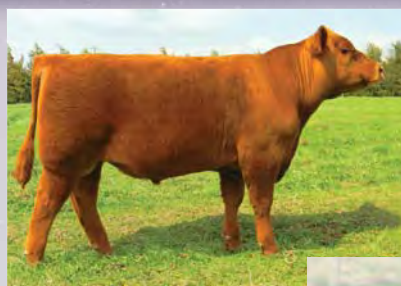
Alta Legend BIL 132X