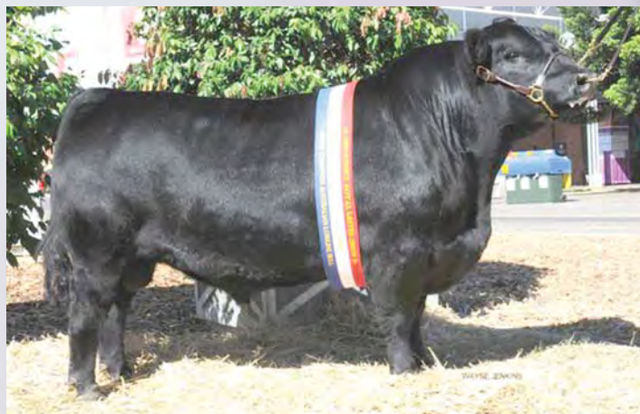
Yarra Ranges Jackaroo

Black Master 01J, the sire of Miss Ultra 3000, could be Quartermaster's very best son. He's a stout made beef bull whose dam was the breed's first champion and the dam of EZ Lisbon 29L. These calves by the Australian Champion Jackaroo should be phenomenal!