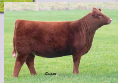
Texas/FCC Red Lacey