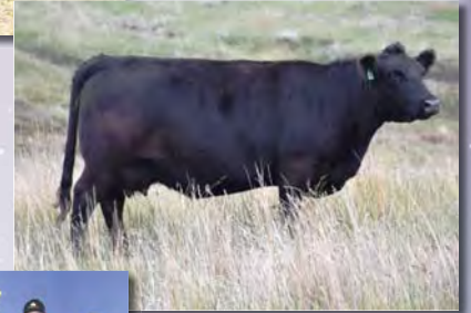
EZ September 45X, donor