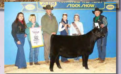
EZ Tenille 42F