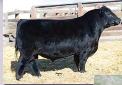
MCR All Jacked Up

September is an own daughter of Athanlee Herman and a full sister to Transam, a big, stout fullblood cow (1100#). This mating combines her depth, capacity and attractiveness with the consistency and tremendous length of All Jacked Up - they will be breed advancers.