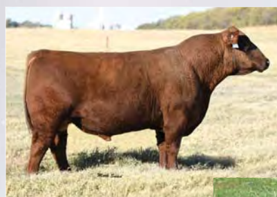
Lazy G Fireproof

Our Red Coral calves have all been very good and we are equally impressed with our Fireproof calves. Putting these two individuals together in a linebred pedigree should produce the genetic consistency we all seek.