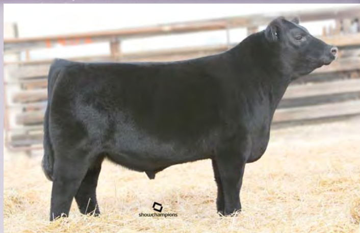
Bonanza's Boxcar 3Y

This red halfblood Red Angus X Simmental donor has produced some spectacular halfblood Aberdeen calves. She will no doubt have some great black/red gene carrier Boxcar calves.