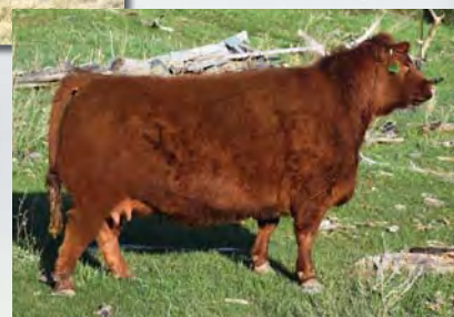
Lazy G Red Coral 4Y11