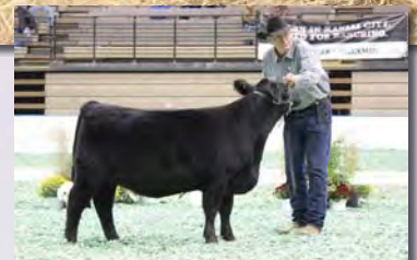
EZ All Dolled Up 02C